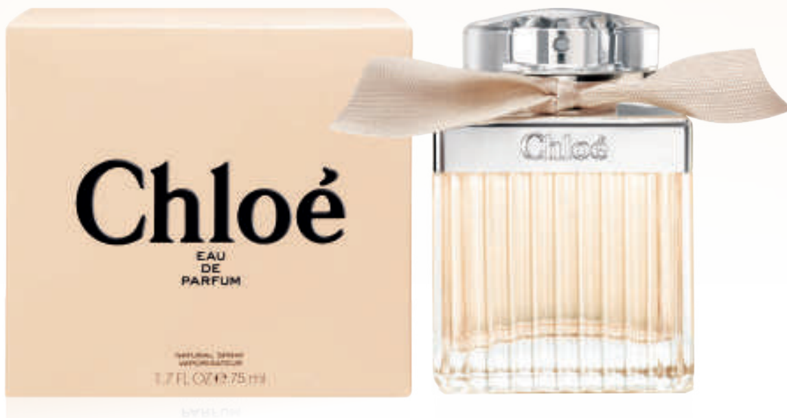
01 | CHLOÉ Signature EDP 75ml

A sublime rose fragrance. At the heart of the Eau de Parfum, the Chloé rose: dazzling and delicate. A velvety bouquet interlacing floral notes of magnolia and honeyed accents of amber. The luxurious pleated glass bottle is crowned with a silver plate and enlaced with the iconic beige ribbon. A new addictive way to wear Chloé. Feminine. Natural. Chic.