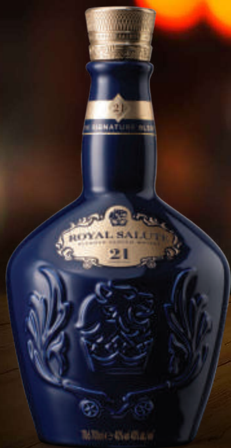
90 | ROYAL SALUTE 21 Year Old The Signature Blend Scotch Whisky 70cL

The ultimate tribute. A prestigious and sumptuous blend of the finest and rarest whiskies from Scotland, has been aged for a minimum of 21 years in oak casks before the Master Blender created this work of art. Its newly streamlined shape gives it a timeless look, embraces prestige, power and grace. Bottles available in a random assortment of sapphire, ruby, and emerald.