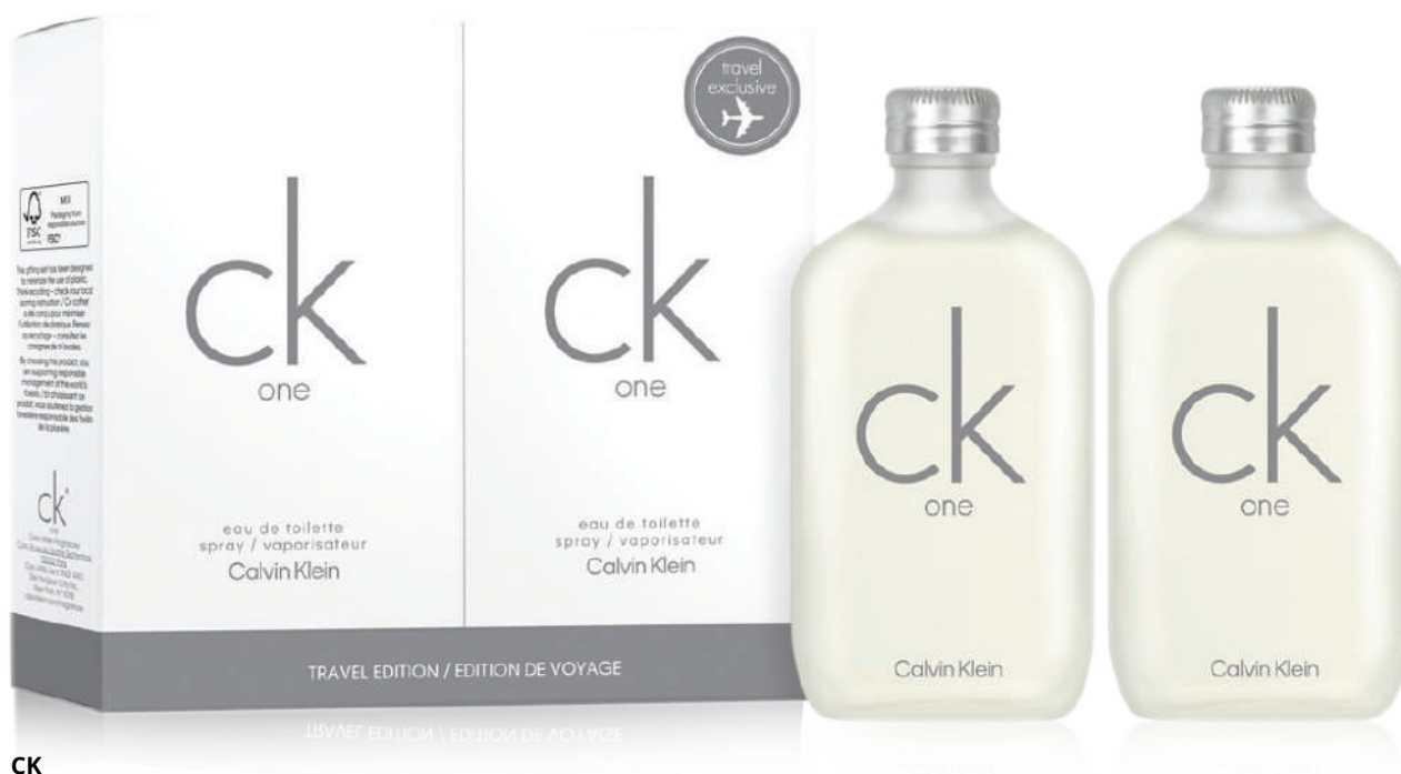
17 | CK One EDT (100ml x2) - Travel Retail Exclusive

Ck One is a naturally clean, pure, and contemporary fragrance with a refreshingly new point of view. This light, relaxed scent is meant to be used lavishly. Ck One Eau de Toilette can literally be splashed all over the body. It is an intimate fragrance, one that you need to be near to smell.