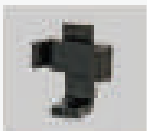
Adjustable Phone Holder