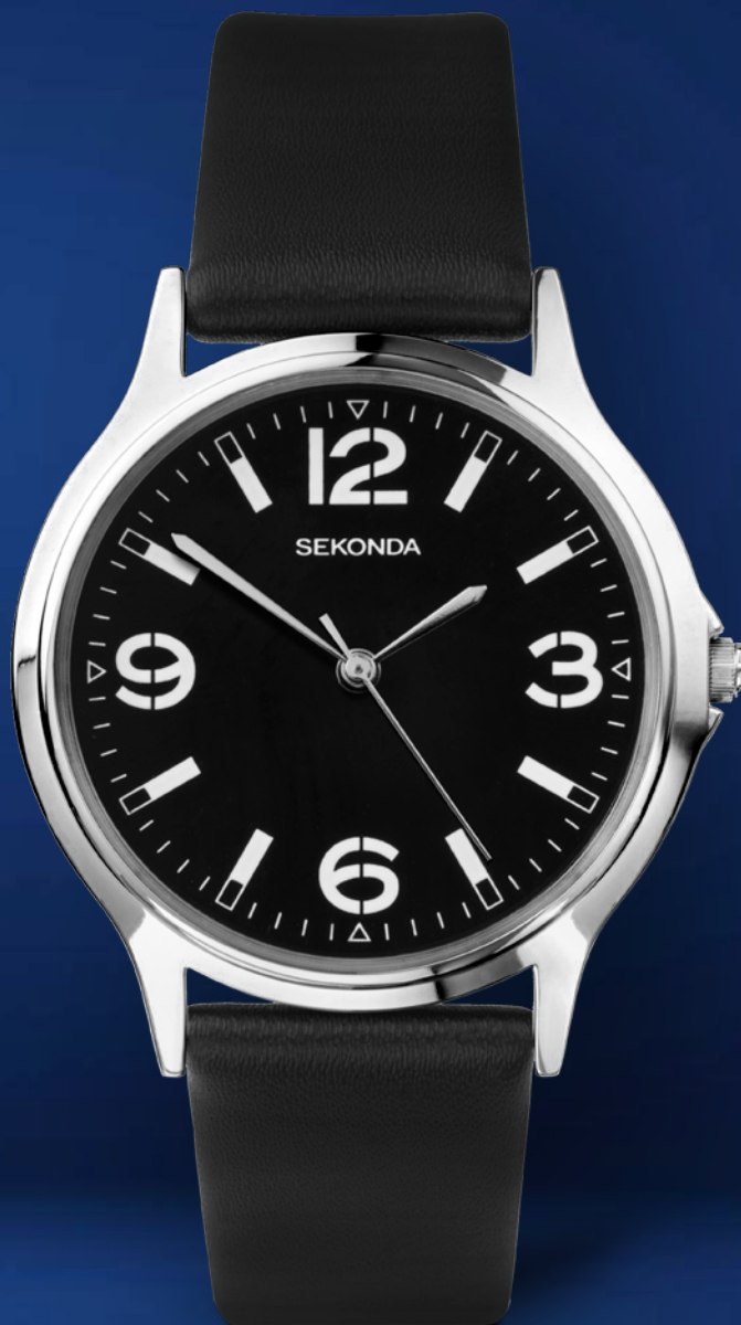
43 | SEKONDA Gents Watch

This classic gents timepiece is brought to you from Sekonda. Features include a black dial with full figures, batons and an outer minute track. Complemented with a black strap.