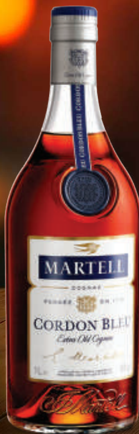
91 | MARTELL Cordon Bleu 1L

Martell Cordon Bleu is the perfect emblem of the Martell style, remarkable for its elegance and aromatic complexity. Cognacs can be classified into several different groups, but most connoisseurs agree that Martell Cordon Bleu is in a class of its own.