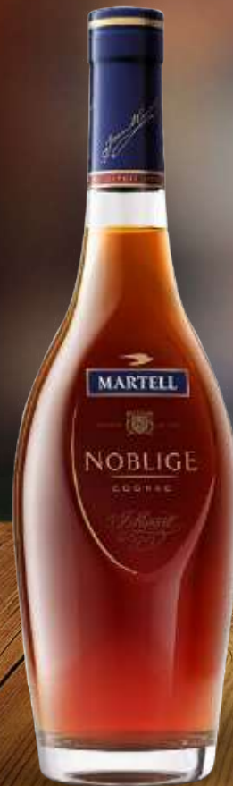
92 | MARTELL Noblige 1L

A superbly stylish cognac whose name refers to the old French saying "Noblesse Oblige", encapsulating the duty of commitment incumbent on people of high rank, Martell Noblige is intended for those who prize the natural elegance of a great cognac.