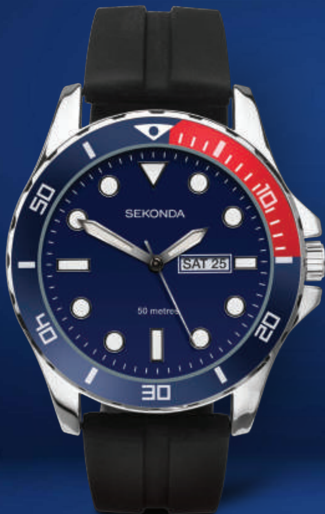
42 | SEKONDA Blue Dial With Batons Gents Watch

This Sekonda gents watch features a blue dial with day/date and rubber strap. Water resistant to 50m.