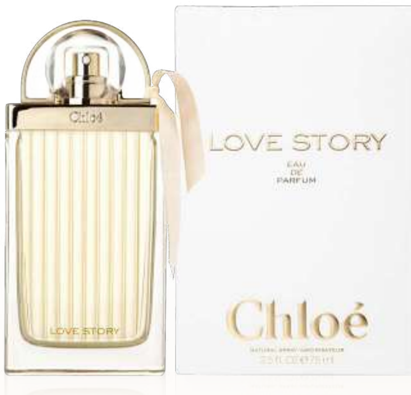
02 | CHLOÉ Love Story EDP Spray 75ml

A floral love story, the Maison's fresh and sensual Eau de Parfum opens the heart with stephanotis jasmine — the flower of happiness — and seduces with luminous orange blossom notes. The unforgettable essence of seduction and freedom is finished with a padlock design to symbolise love and romance. A delicate ribbon knotted casually on the side complements the femininity of the pleated glass. Size: 75ml (2.5 fl oz), A fresh floral fragrance, Top: neroli, Heart: orange blossom, stephanotis jasmine, Base: cedar wood.