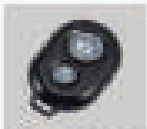
Bluetooth Remote Control Shutter