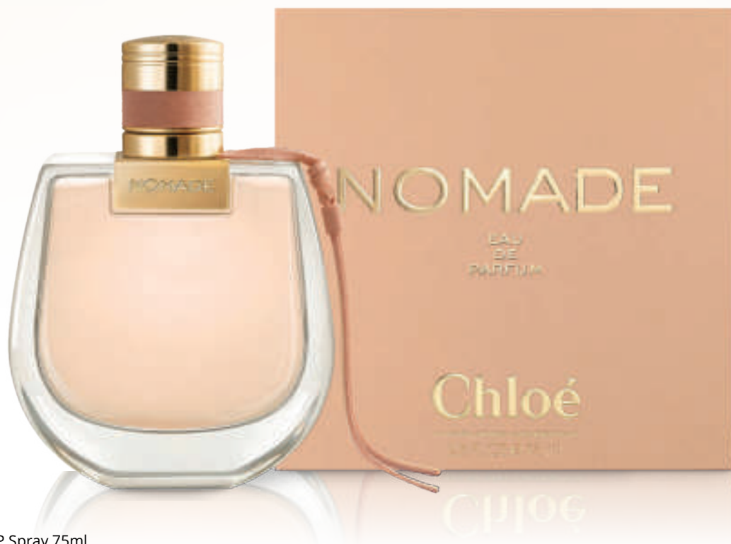
03 | CHLOÉ Nomade EDP Spray 75ml

Size: 75ml (2.5fl oz), A woody fragrance with floral notes, Top: Mirabelle plum, Heart: Freesia, Base: Oak moss, Embrace a spirit of adventurous femininity uplifted by distant horizons and inspiring encounters: Chloé Nomade Eau de Parfum is a woody fragrance with fresh, floral notes.