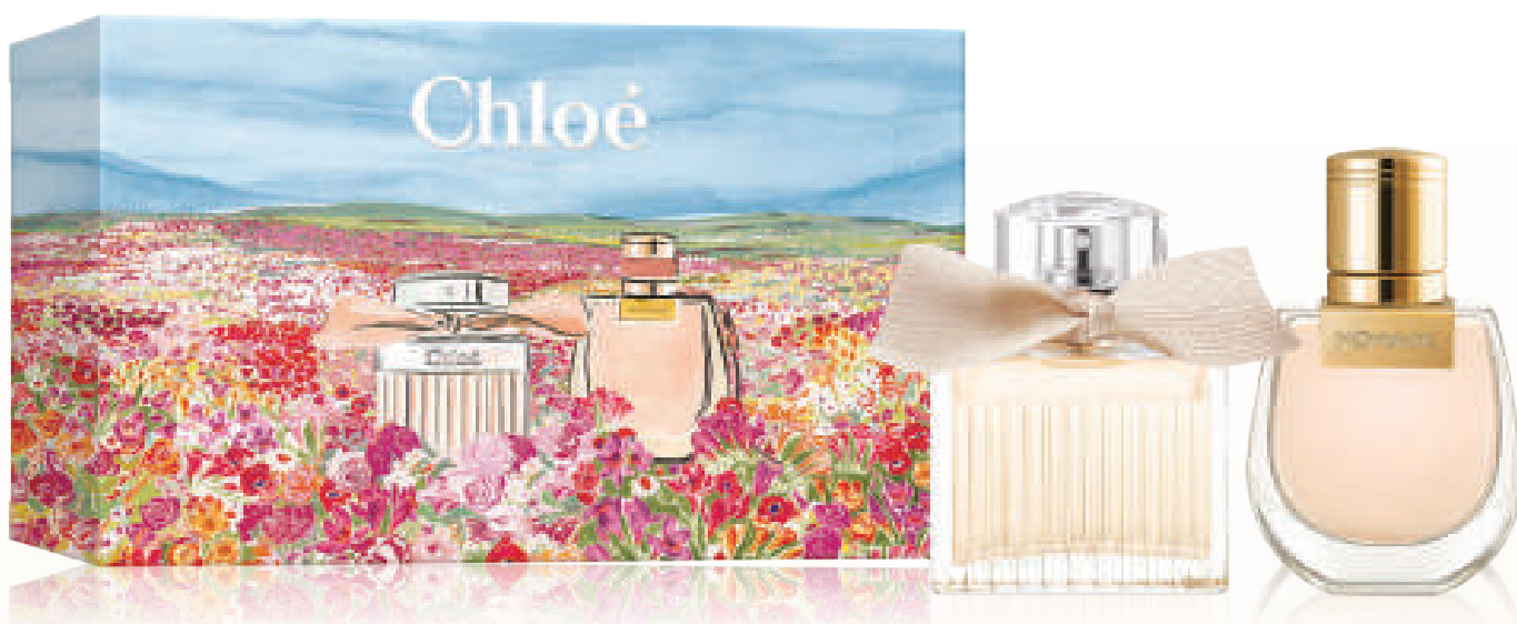
04 | CHLOÉ Eau De Parfum Gift Set

Discover Chloé flower meadow, celebrating Mother's Day in a poetic landscape. Take a walk into this colourful nature, breathing the scent of roses. This duo mini set contains: •Chloé Eau de Parfum for Women 20ml •Chloé Nomade Eau de Parfum 20ml.