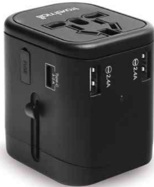
High Performance (4.5A) Four USB World Travel Adaptor (3 USB-A & 1 USB Type C)