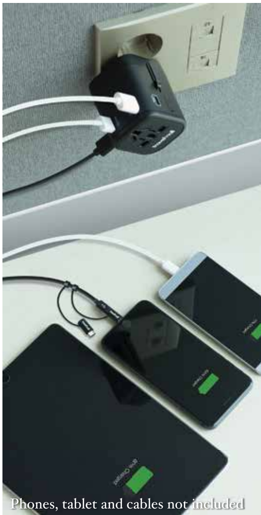
Phones, tablet and cables not included