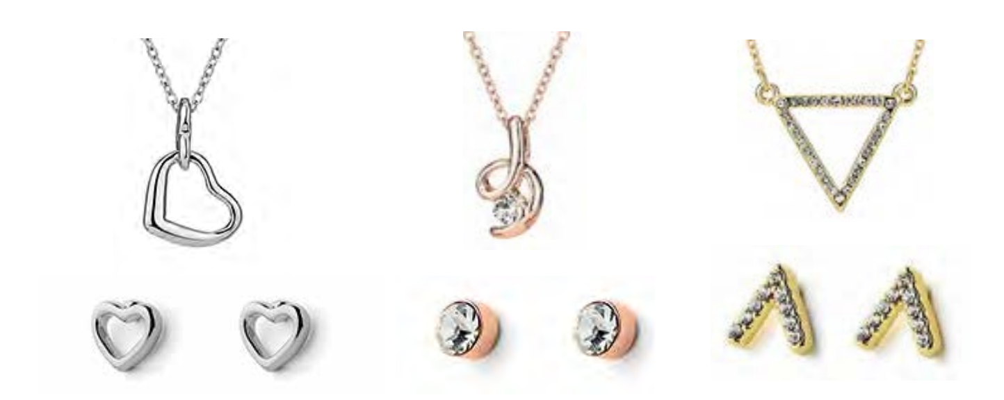
54 | PIERRE CARDIN Triple Pendant & Earrings Set

Three pendants plated in silver, gold and rose gold, two pairs matching earrings/pendant. Packaged in three boxes.