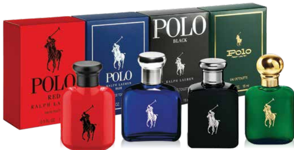
43 | RALPH LAUREN World of POLO Collection EDT (15ml x 4)

Experience the Classic POLO or the Fresh Masculinity of POLO BLUE, enjoy the POLO BLACK sophisticated fragrance or the newest POLO RED spicy blend. It is a unique opportunity to discover the Ralph Lauren masculine fragrance collection or to offer it to your beloved ones! It is also a light and convenient size for traveling.