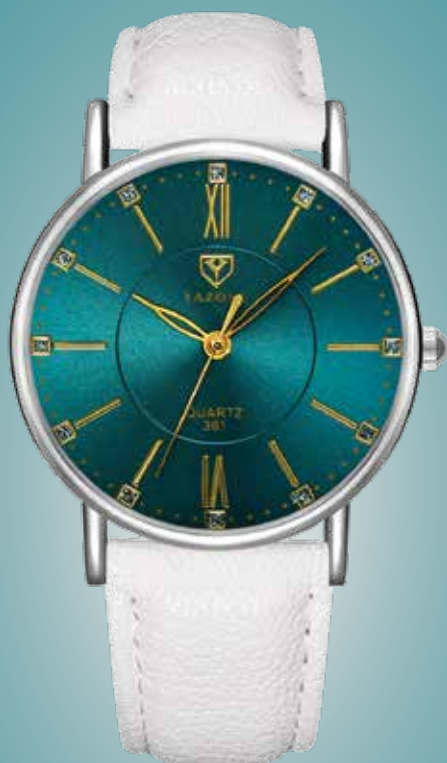
20 | YAZOLE Ladies Watch - White Strap With Green Dial

A stylish and versatile women's watch that's perfect for day or night. Features a quartz 3-pointer movement, an elegant aquamarine dial, Rose Gold shaded bezel, stainless steel back, white vegan-leather strap and 3 ATM water resistance.