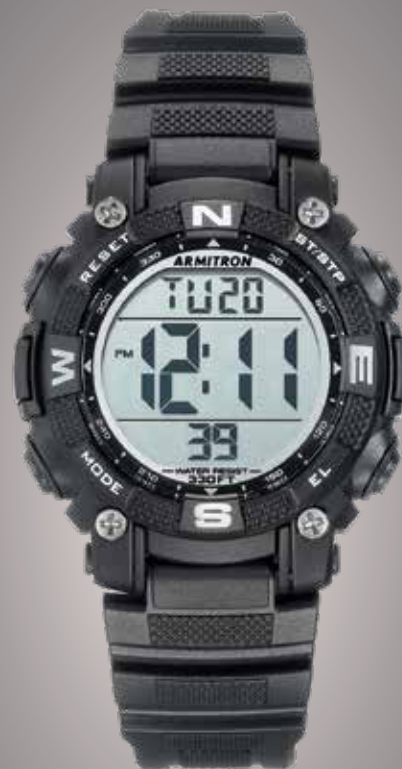
18 | ARMITRON Gents Digital Watch

38mm Round Black digital strap. Features 12 and 24-hour time, seconds, day/date, chronograph with lap time, alarm, dual time, and EL function. Black polyurethane strap with textured center sections, black polyurethane loop and brushed stainless steel back and buckle.