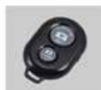
Bluetooth Remote Control Shutter