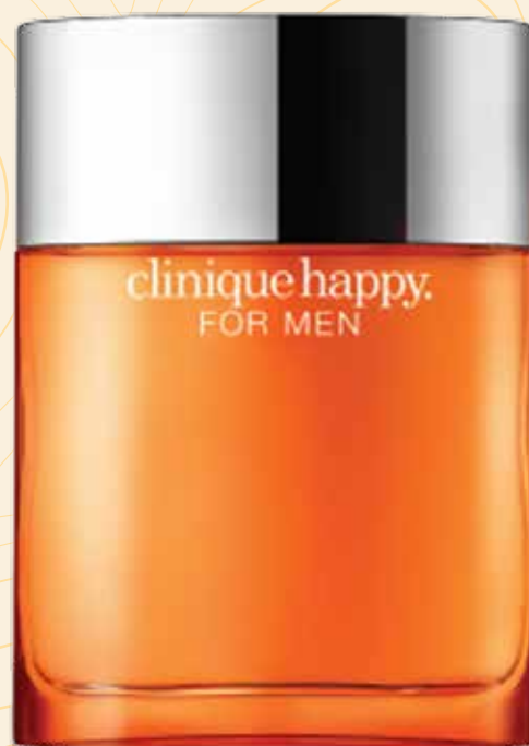
35 | CLINIQUE Happy For Men 100ml

Cool. Crisp. A hit of citrus. A refreshing scent for men. Wear it and be happy. Allergy Tested.