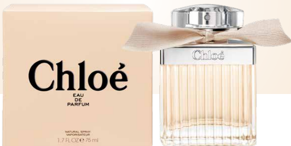
23 | CHLOÉ Signature EDP 75ml

A sublime rose fragrance. At the heart of the Eau de Parfum, the Chloé rose: dazzling and delicate. A velvety bouquet interlacing floral notes of magnolia and honeyed accents of amber. The luxurious pleated glass bottle is crowned with a silver plate and enlaced with the iconic beige ribbon. A new addictive way to wear Chloé. Feminine. Natural. Chic.