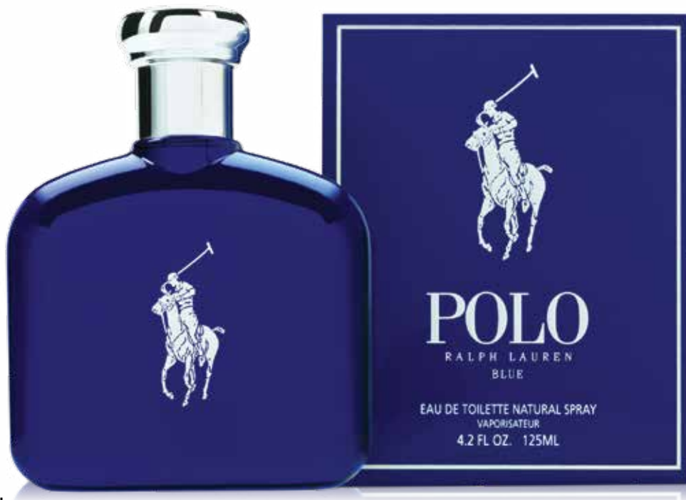
42 | RALPH LAUREN POLO Blue EDT 125ml

With Polo Blue, Ralph Lauren bottled the freedom of the blue sky, the energy of the open waters and an invigorating blast of fresh air. The scent is an exhilarating blend of melon, basil verbena and white suede, for the champion who lives life to the fullest.