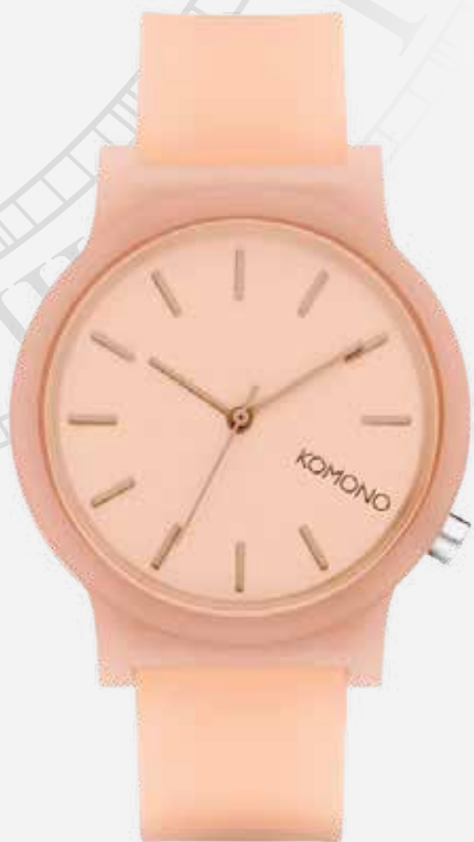
17 | KOMONO Blush Ladies Watch

Distinct, diverse, unique. The Mono is all about expressing yourself. Choose from an array of spectacular colorways. Consisting of a matching translucent silicone strap, PC case and colored acrylic glass, the collection is the ultimate declaration in monochrome. Japanese Quartz Movement. Case Water Resistant 5 ATM. Acrylic Glass. Quick Release Spring Bar Wristband. Diameter 38,4mm. Contemporary watch, designed in Antwerp (Belgium).