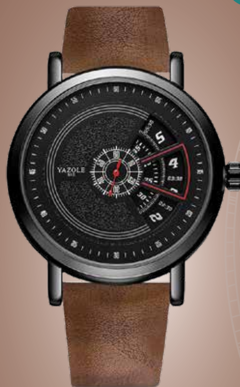
21 | YAZOLE Digital Mens Watch Contemporary

An unique men's digital watch carefully designed to combine utility and elegance. Large face design dial with 5 pointers and Quartz movement. A stainless steel case, earth buckle clasp and faux leather strap for durable and comfortable wearing experience. Water resistant 3ATM.