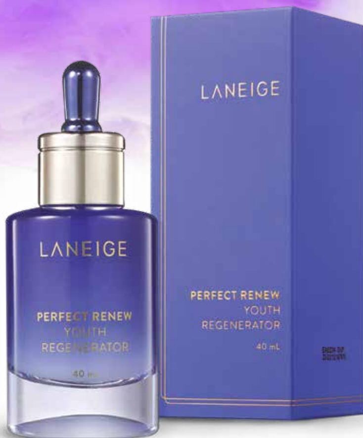
48 | LANEIGE Perfect Renew Youth Regenerator 40ml

Total anti-aging essence that reduces five signs of early skin aging.