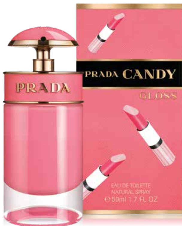
26 | PRADA Candy Gloss EDT 50ml

Prada Candy Gloss is a new expression of the Prada woman, where femininity is excessive yet tender, and where indulgence is always sophisticated. Juicy, sparkling and intensely joyful: Prada Candy Gloss is a sensual sorbet, sweet as acid cherry and solar as the orange blossom. A fruity bouquet with hints of rose and musk.