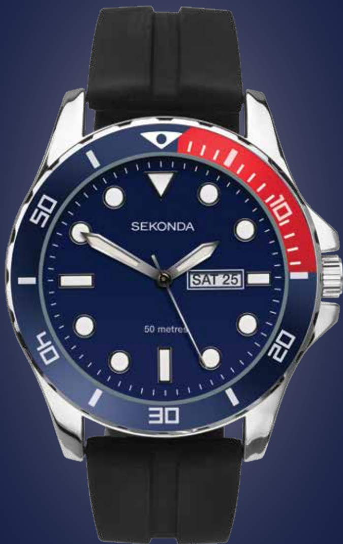
10 | SEKONDA Blue Dial With Batons Gents Watch

This Sekonda gents watch features a blue dial with day/date and rubber strap. Water resistant to 50m.