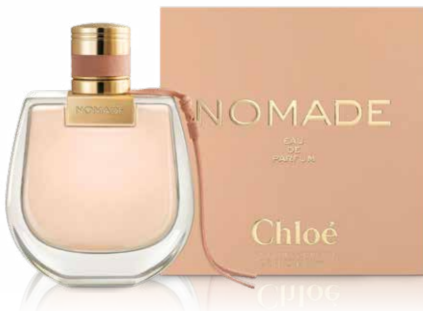
24 | CHLOÉ Nomade EDP Spray 75ml

Embrace a spirit of adventurous femininity uplifted by distant horizons and inspiring encounters: Chloé Nomade Eau de Parfum is a woody fragrance with fresh, floral notes.