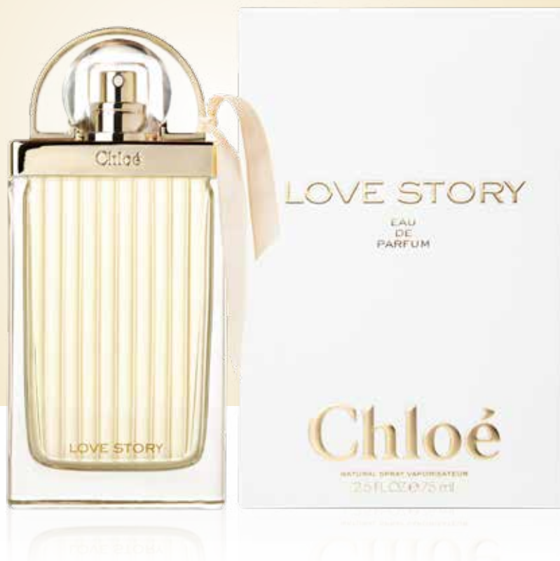
25 | CHLOÉ Love Story EDP Spray 75ml

A floral love story, the Maison's fresh and sensual Eau de Parfum opens the heart with stephanotis jasmine the flower of happiness and seduces with luminous orange blossom notes.