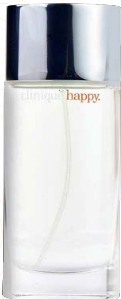
34 | CLINIQUE Happy for women 100ml

Surround yourself in the cheery vibrance of a sun-touched orchard when you wear this Happy eau de parfum spray for women.