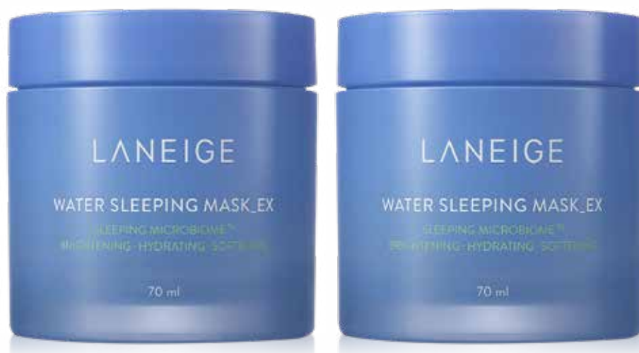
49 | LANEIGE Water Sleeping Mask Ex Duo 70ml

Overnight mask featuring Sleeping Micro Biome™ and enhanced Pro-biotics Complex that strengthen the skin's defense to realize a well-slept, bright and clear complexion.