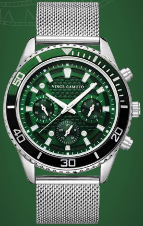
13 | VINCE CAMUTO 44mm Silver-tone Steel Mesh Green 3 Eye Dial

44mm analog round silver-tone stainless steel mesh band watch. Features silver-tone coin edge bezel with green top and a silver-tone numeral seconds track. Multi-zone green dial with silver-tone hands and markers. Dial features day of the week, date, and 24-hour sub dials. Polished silver-tone stainless steel mesh band with stainless steel sliding adjustable buckle closure. Splash resistant.