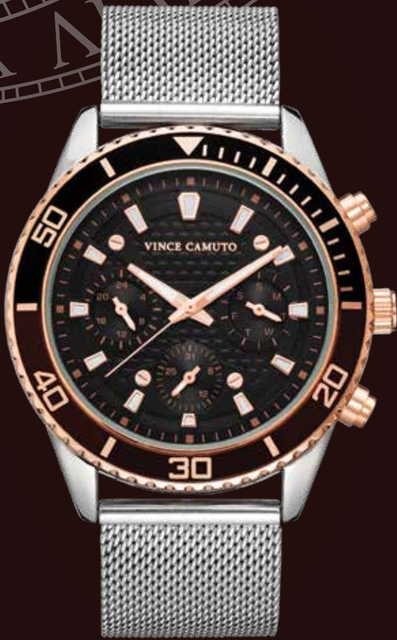
12 | VINCE CAMUTO 44mm Silver-tone Steel Mesh Black Rose 3 Eye Dial

44mm analog round silver-tone stainless steel mesh band watch. Features rose gold-tone coin edge bezel with black to brown ombre top and a rose gold-tone numeral seconds track. Multi-zone black dial with rose gold-tone hands and markers. Dial features day of the week, date, and 24-hour sub dials. Polished silver-tone stainless steel mesh band with stainless steel sliding adjustable buckle closure. Splash resistant.