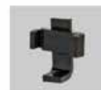
Adjustable Phone Holder