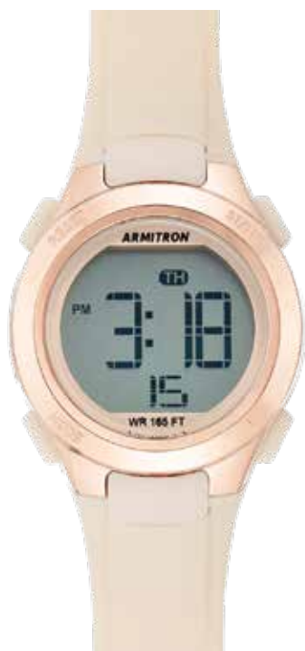
19 | ARMITRON Ladies Digital Watch

27mm Round Blush digital strap. Features polished Rose Gold-tone stainless steel top ring. Hours, minute seconds, day chronograph, alarm and EL function. Blush matte polyurethane strap and loop with stainless steel case and buckle.